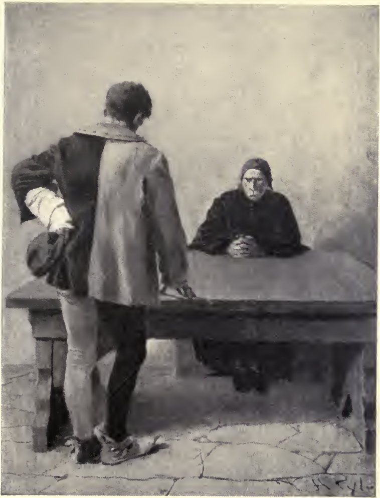
“Belike thou sought to take this lad’s life,” said Sir James”